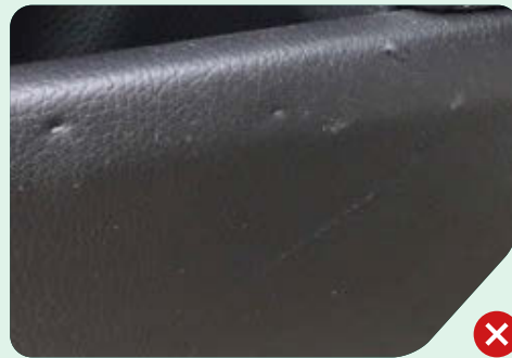
Holes to the interior upholstery and trim and not acceptable.