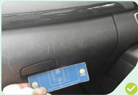
Scratches that reflect normal use are acceptable.