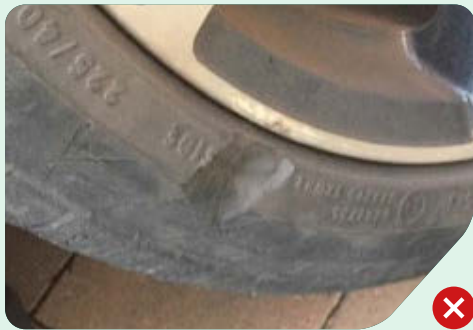
Tyre sidewall damage is not acceptable.