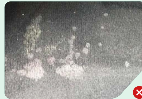
The interior of the vehicle must be clean and odourless with no burns, scratches, tears, dents or staining.